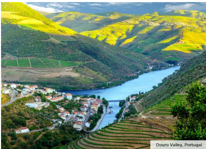
Douro Valley, Portugal