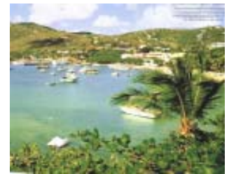
St. Thomas, USVI

Some cabin categories are very limited - book now!