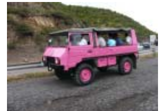
St. Maarten fun!

3rd/4th in same cabin: from $498 (same cabin with 2 full fare persons) from $ 689 (Balcony cabin)