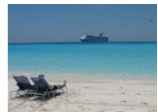
Your Private Island

DEPOSIT: 20 % of cruise fare Final payment due: August 23, 2013