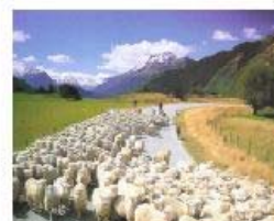
Sheep in New Zealand